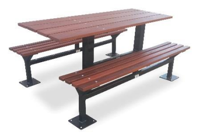
EM050 The George Setting with wheelchair access option (DDA heights available)