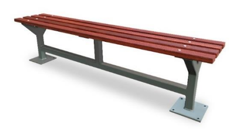
EM107 The George Bench or EM108 The George Table are also available separately