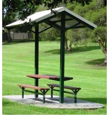
Shelter option with setting, EM512 Grevillea Shelter and EM050 The George Setting